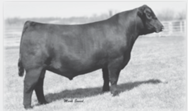
SAV Brilliance 8077 - Sire of Lots 13, 29 and 30.