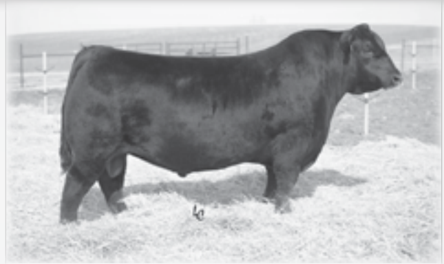
RB Tour of Duty 177 - Sire of Lots 10, 11, 12, 21 and 23.

R&W Angus Farm Warren & James Mostillo 1368 Beason Cove Rd Steele, AL 35987 (205) 914-8910 (256) 515-3910 Lots 9-20