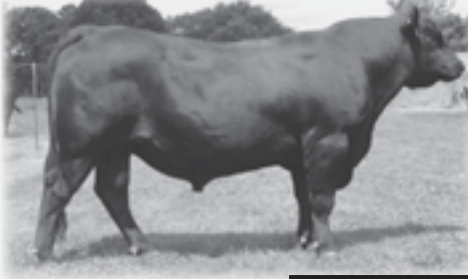
S A V International 2020