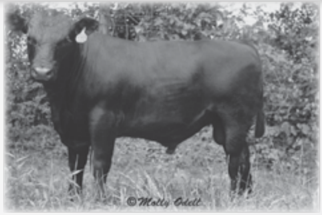
Tates Cliff 5R7 - Lot 7