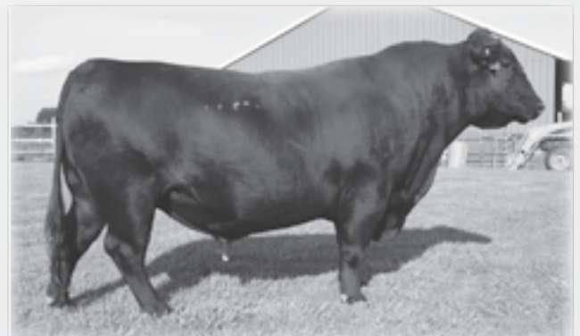
S A V Silverado 0355 - Sire of Lots 43, 44 and 45.