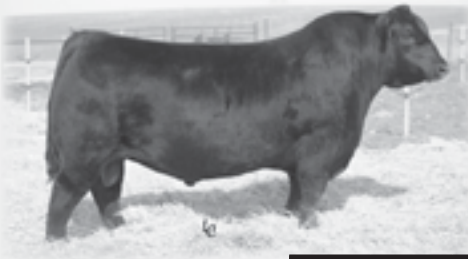
R B Tour Of Duty 177