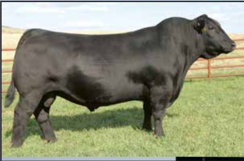
S AV Renown 3439 Selling six sons!