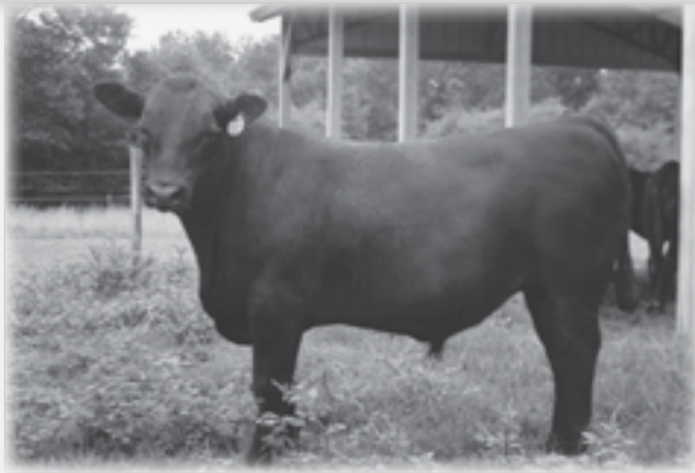
Tates Renown 5R4 - Lot 4