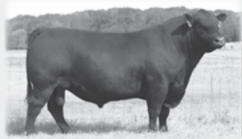
Yon Future Focus T219