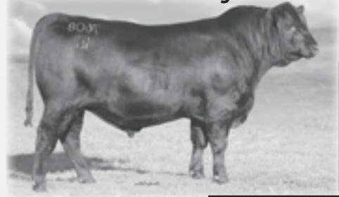
G A R Progress