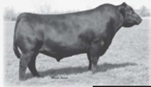
MF Net Return 8197