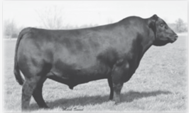
MF Net Return 8197 - Sire of Lots 22, 24 and 31.