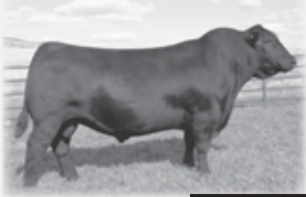
S A V Renown 3439