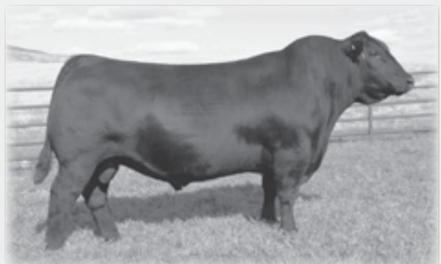
SAV Renown 3439 - Sire of Lots 2, 4, 5, 7, 33 and 34.