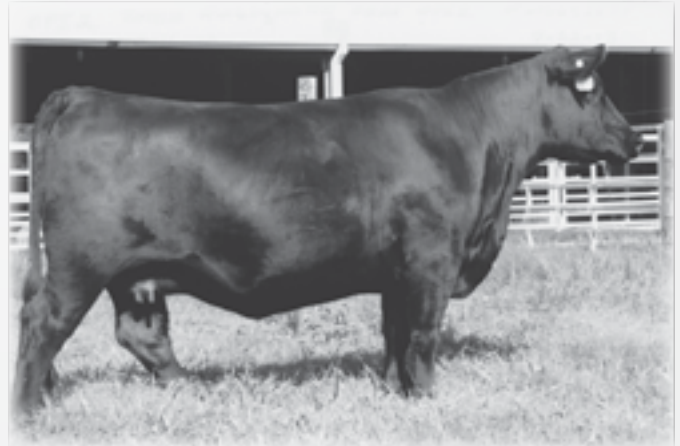
Tates Emblynette 8521 OPI2 - Dam of Lots 1, 4, 5 and 6.