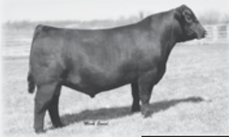
S A V Brilliance 8077