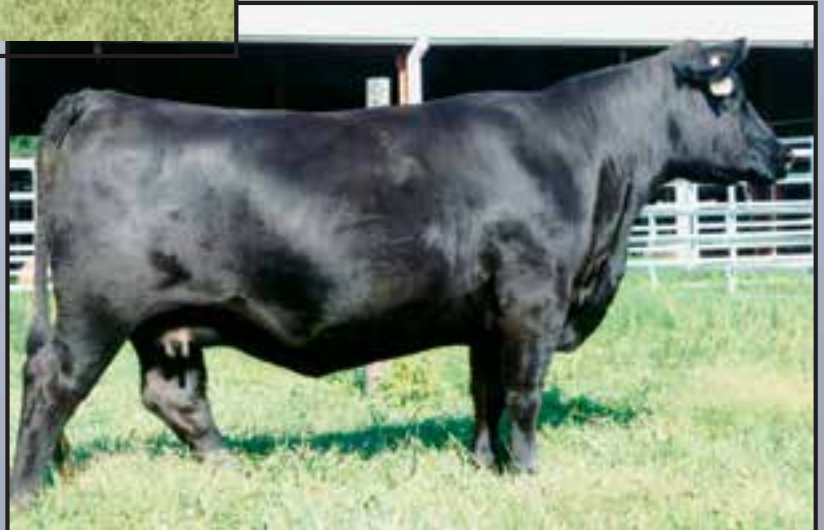
Tates Emblynette 8521 OPT2 Selling four sons!