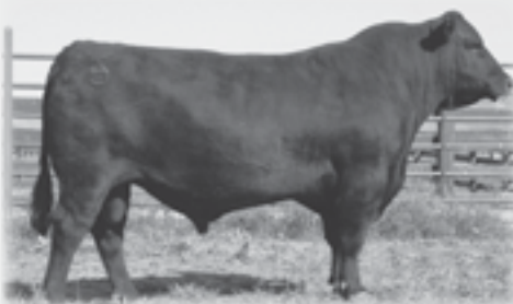
A A R Ten X 7008 S A