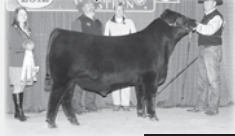
Cherry Knoll Ideal Product