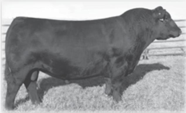
SAV International 2020 - Sire of Lots 1, 8 and 16.